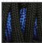
THIN BLUE LINE