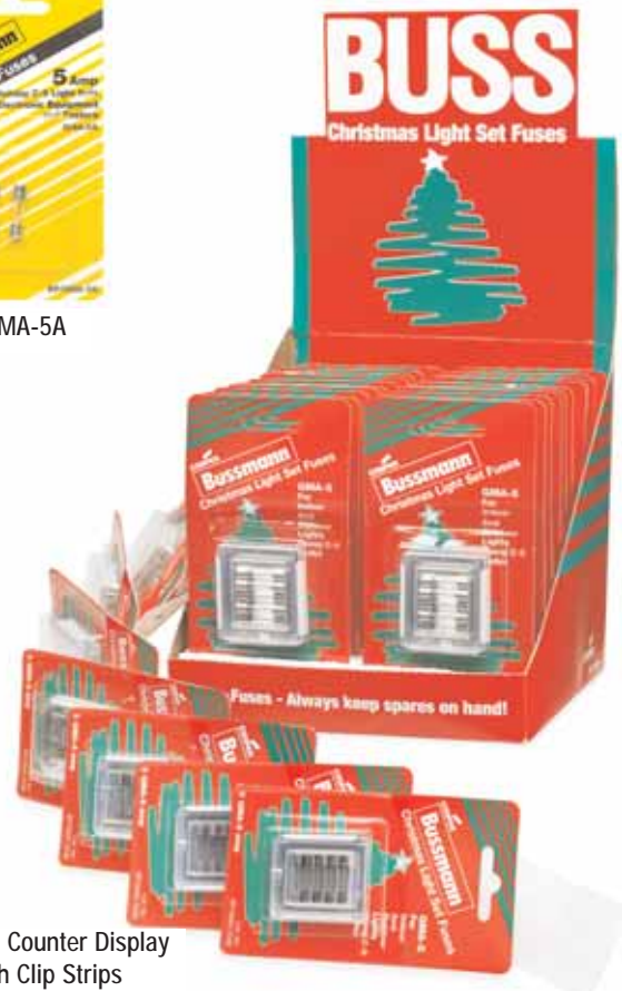
20-Card Counter Display with Clip Strips