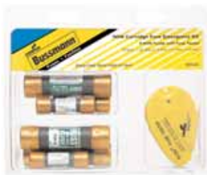
NON-EK - NON Cartridge Fuse Kit: 20, (2)30, 40 & (2)60A and FT-2 Fuse Tester.