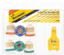
TL-EK - TL Edison Base Plug Fuse Kit: 15, (2)20 & (3)30A and FT-3 Fuse Tester.