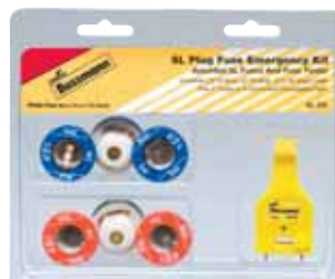
SL-EK - SL Rejection Base Plug Fuse Kit: (3)15, (2)20 & 30A and FT-3 Fuse Tester.