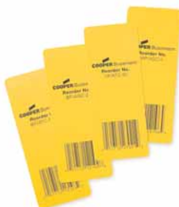
Bar-Coded Reorder Tabs